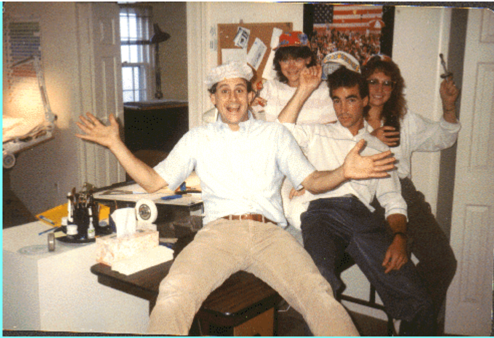
The mad gang at its antics

Incredible gales of laughter seemed to come regularly out of the Art Department in that rambling building on Welsh Road in north Wales. We copywriters had fun, but there must've been something punchy in those rubber cement fumes they breathed in the next room!